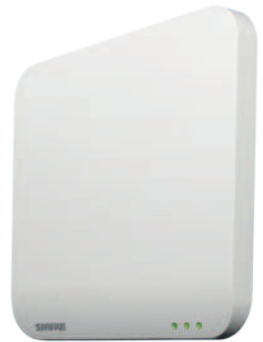
MXWAPT Access Point Transceiver