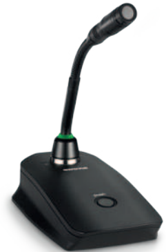
MXW8 Gooseneck Base Transmitter