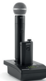
MXWNCS2 Networked Charging Station shown with MXW2/SM58 and MXW6