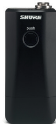
MXW1 Bodypack Transmitter