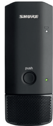
MXW6 Boundary Transmitter

The Shure MXW6 is a boundary microphone transmitter compatible with Microflex® Wireless Systems. With a low-profile design and cardioid or omnidirectional polar pattern options, the MXW6 allows flexible placement with excellent audio capture on any surface in front of one or multiple speakers. All Microflex Wireless transmitters deliver pristine audio quality, intelligent wireless performance, encrypted transmission, and advanced rechargeability for conferencing and presentation applications.