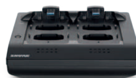
MXWNCS4 Networked Charging Station